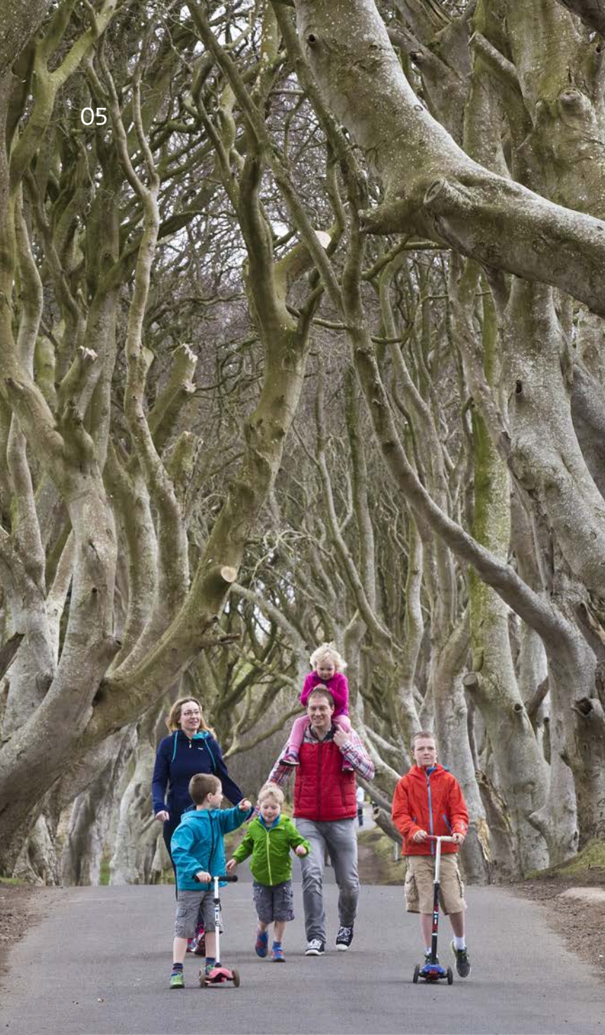
Dark Hedges, County Antrim

Encouragingly, there are no major barriers impeding the domestic market from taking a break in Northern Ireland. However, approximately one in five consumers indicate they are just not 'motivated' to travel. Part of the lack of motivation relates to the belief that taking a break in Northern Ireland 'isn't really getting away' – although this is a view held by the minority of residents. Breaking embedded inertia represents a significant opportunity to drive growth within the domestic market.