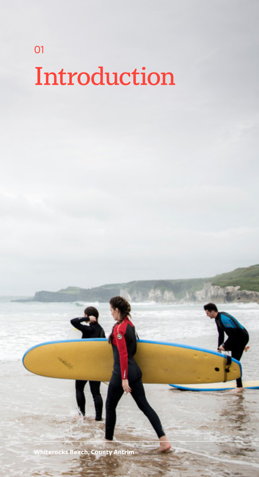
Whiterocks Beach, County Antrim

The domestic market is a critical part of Northern Ireland's tourism economy. In 2018 the domestic tourism accounted for 44 percent of all overnight trips taken in Northern Ireland and 31 percent of spend. 1 In real terms this equates to approximately 2.2 million overnight trips and an estimated expenditure of £300 million by Northern Ireland residents.