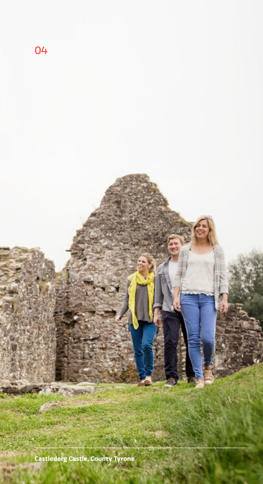
Castleberg Castle, County Tyrone

On one level this is a cause for concern as Northern Ireland residents may not choose to take short breaks. However, it may also be argued that consumer sentiment may encourage people to take more domestic trips rather than out of state breaks. With this in mind it will be important that consumer sentiment and how it impacts, positively or negatively, on travel is closely monitored.