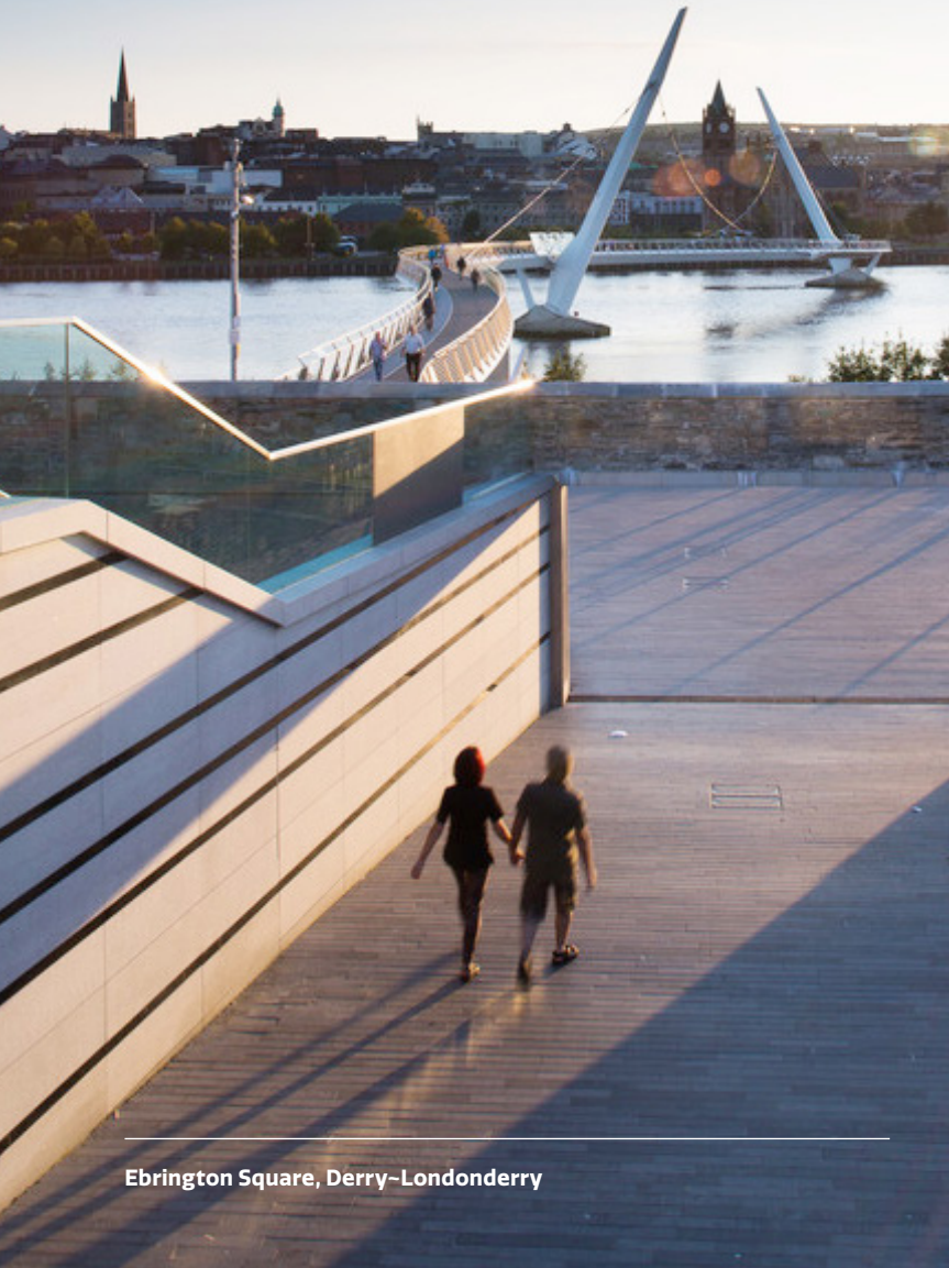
Ebrington Square, Derry-Londonderry