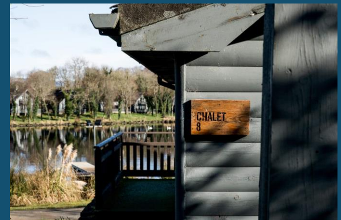
Lusty Beg, Kesh

4% of the available hotel rooms in NI are in Fermanagh & Omagh LGD.