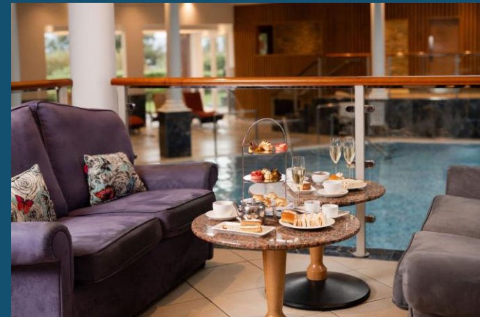
Culloden Estate and Spa, Cultra