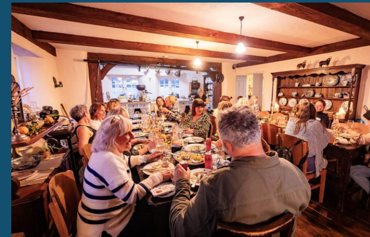
Rosehill House, Stewartstown