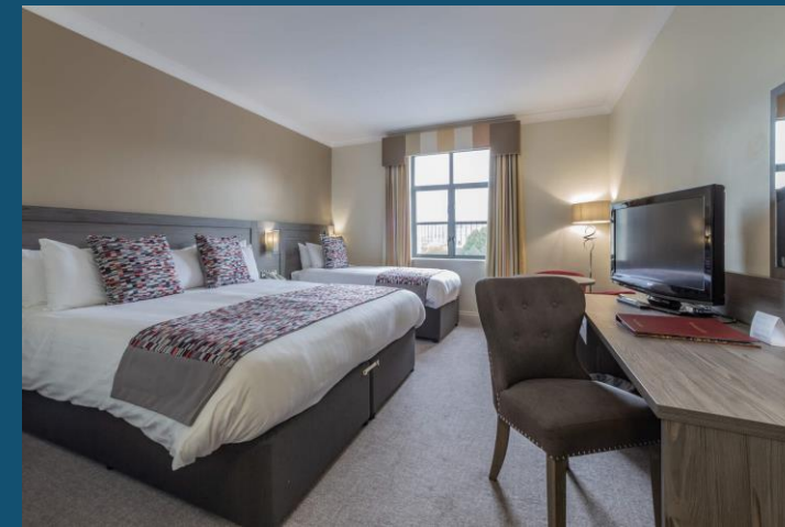
Armagh City Hotel