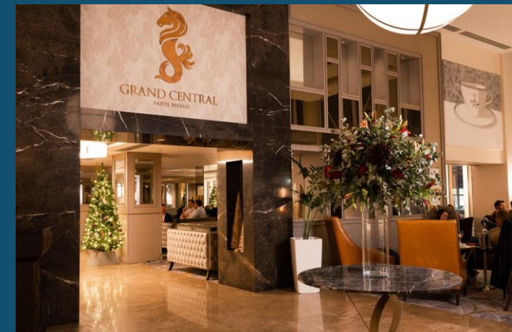
Grand Central Hotel, Belfast