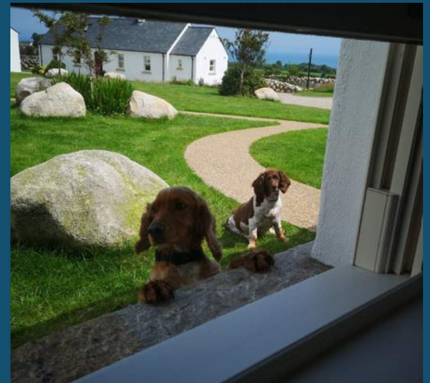
Kribben Cottages, Newcastle

This LGD has 6% of the available hotel rooms in NI.