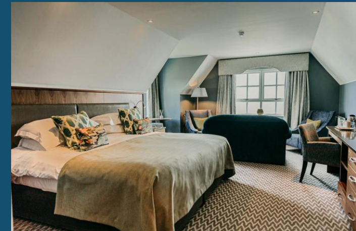
Ballygally Castle Hotel

Mid & East Antrim has 6% of the available GH/GA/B&B rooms in NI and 5% of the available self-catering rooms.