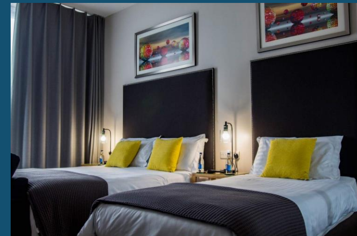
The James Suites Apartment, Derry-Londonderry