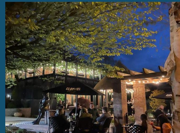
The Rabbit Hotel & Retreat