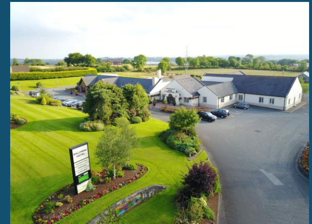
The Ballymac Hotel, Lisburn